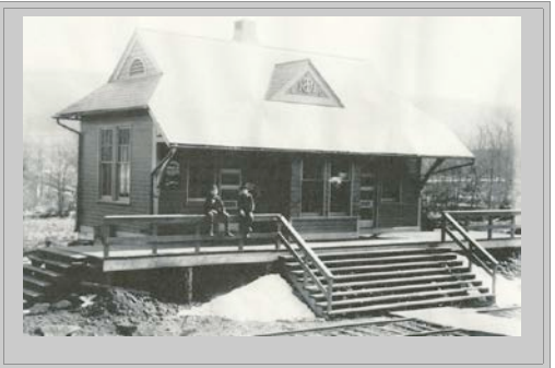
"Claggett's Station" was a stop on the Washington County Branch of the B&O Railroad, which connected the mainline to Hagerstown.