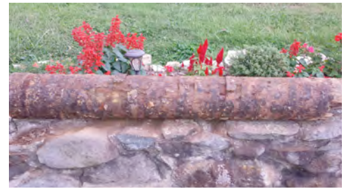
Excavated Pipes Before and After Cleaning- by Jody Brumage