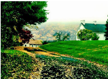
Burkittsville in the Fall