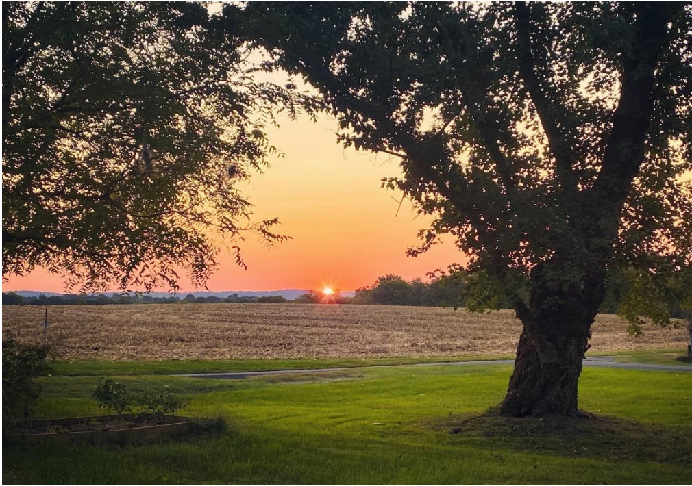
Autumn Sunrise