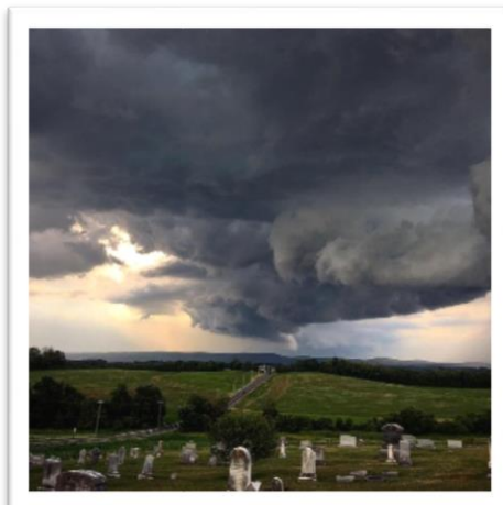
Summer thunderstorms can pop up very quickly! They are beautiful but please use caution! Photo taken in Burkittsville Union Cemetery by Jody Brumage