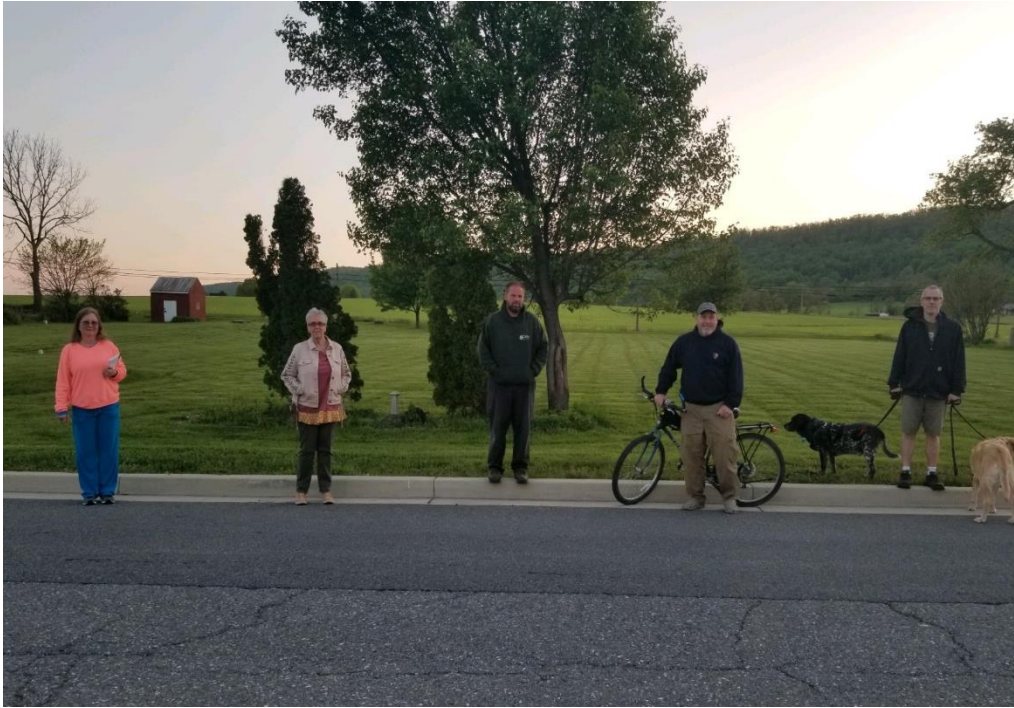
Town Council, Clerk, and P&Z Commissioner Embarking on the May Walking Meeting