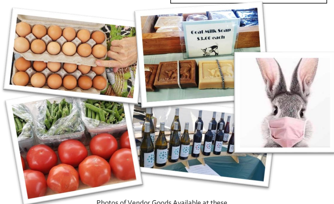
Photos of Vendor Goods Available at these local Farmer's Markets.