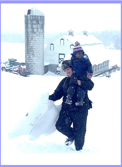
Spring Sledding Free Ride