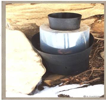
This GAT was placed outside on 3/3/18 and is still standing after the storm. The secret? A rock inside the bottom of the GAT.