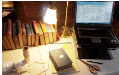
Processing one such rare book in the SMHS - essential work in preserving the history of local adventurers and accomplished figures.