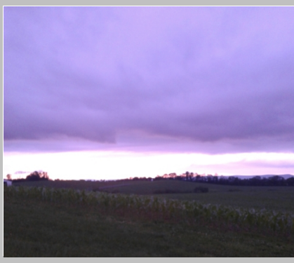
Purple Sky