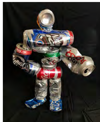
Art From Adopt A Road By Lesley Frowick