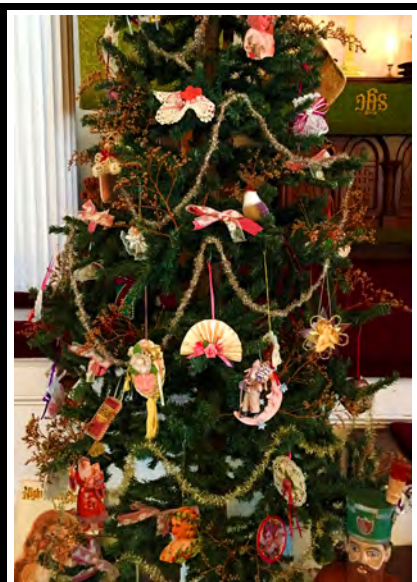
Museums By Candlelight 2017 SMHS